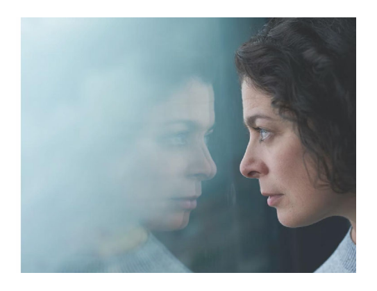
Top 10 Ways to Ruin Your Retirement

Don't mess up your federal retirement with silly mistakes - read this.